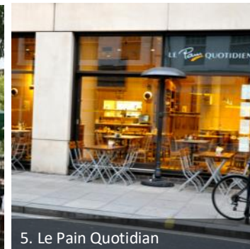
5. Le Pain Quotidien