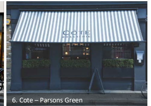
6. Cote - Parsons Green