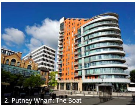
2. Putney Wharf: The Boat