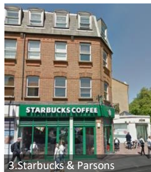
3. Starbucks & Parsons