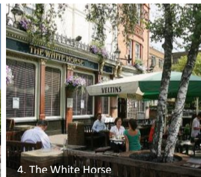
4. The White Horse