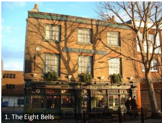
1. The Eight Bells